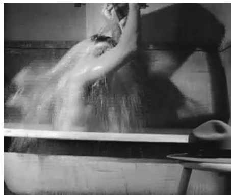
Figures 1–3. Bathtub imagery is strikingly similar across a range of texts ( Quantum Leap [NBC, 1989–1993]; Buffy the Vampire Slayer [WB, 1997–2001; UPN, 2001–2003]; Due South [CTV and CBS, 1994–1999]) used in the Clucking Belles' fan vid, “A Fannish Taxonomy of Hotness (Hot Hot Hot!)” (2005).