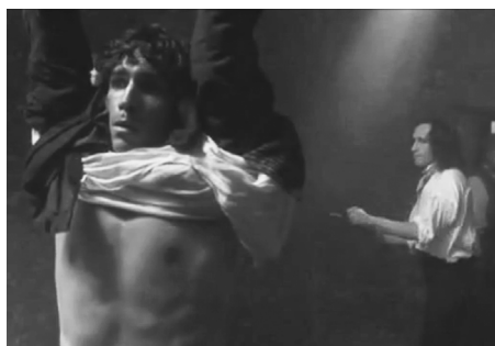
Figures 4–6. Vidders target the recurring sadomasochism of mass culture ( Blake's 7 [BBC1, 1978–1981]; Buffy the Vampire Slayer [WB, 1997–2001; UPN, 2001–2003]; The Count of Monte Cristo [Buena Vista, 2002]).

in parts. Film editing was historically open to women, as it was thought to be related to sewing, 5 but this emphasis on bringing things together may blind us to another important part of vidding: clip selection, which is isolating particular images and movements and cutting them from the whole. VCR vidders, who began vidding when home recording equipment became popular in the early 1980s, had a surplus of images from which to choose: as much videotape as they and their friends could record from broadcast television. Today's vidders have all the power of computer editing software and the picture quality of DVDs and high-definition digital AVI files. These vidders see parts—tropes, movements, frames—within larger narratives that are presented to them as unified and complete, and they reassemble them into coherent wholes of their own devising. Their vids reappropriate objects and turn them into sites of pleasure and surplus. This surplus is not just psychic but economic. Vidding is a nonprofit activity partly because there's no scarcity: the same footage can be used to make thousands of different vids.