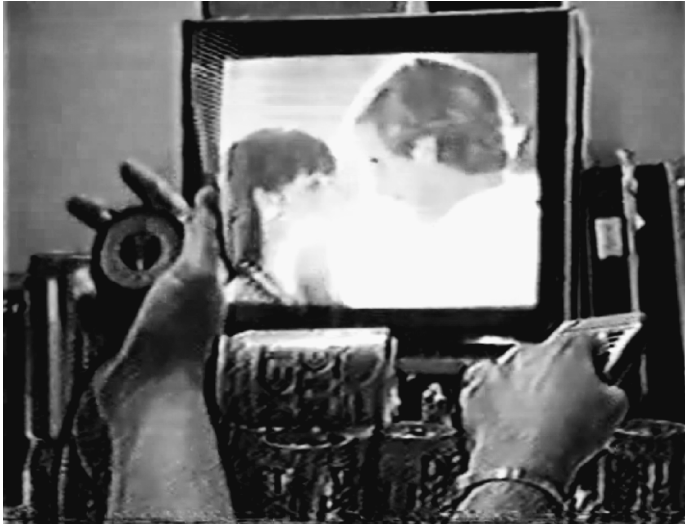
Figure 7. Vidders time clips in the metavid “Pressure” (1990), by Sterling Eoilan and the Odd Woman Out.

and other trivia—female fans collect images, VHS cassettes, and DVDs, just as they historically collected fan magazines, autographs, and still shots. It is common in fan communities for fans to create and share online galleries of screencaps—often referred to as “picspam”—which isolate particular frames of a favorite television show. These still shots typically feature the show’s “BSO” (“beloved sex object” or “bright shiny object,” depending on the community). BSOs include beloved, sexually objectified, and typically male characters like Fox Mulder of The X-Files (FOX, 1993–2002) or Supernatural ’s (WB, 2005–2006; CW, 2006–present) Dean Winchester. Just as the Clucking Belles cut up and edited sexy tropes together in “A Fannish Taxonomy of Hotness,” picspams can be dedicated to a BSO’s particular body parts. Arms, necks, mouths, and bellies are popular visual subjects. Computers make creating and sharing picspam easy, but the power to pause, to stop time, and to frame one’s own still shots came with the rise of the VCR.